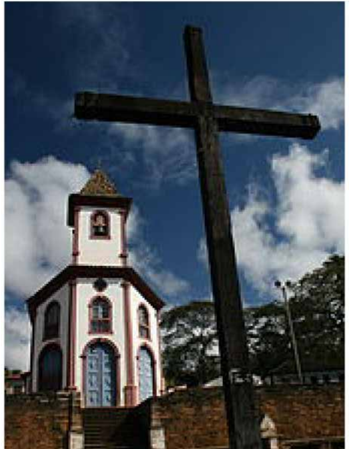
18th Century Nova Era Church

Brazil does however have amazing highways that are true great engineering masterpieces traversing the country's rugged mountains though complex bridges and tunnels. Route 381 is one of the twelve major Brazilian highways and links the Minas Gerais interior with the Atlantic Ocean bringing thousands of people through the small town of Nova Era each day.