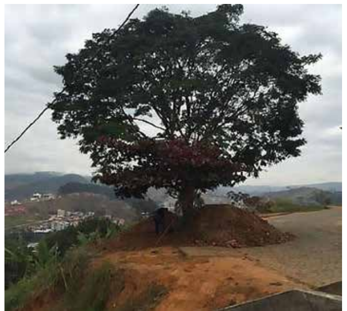
Stage 2 – Tree Planting - 2014