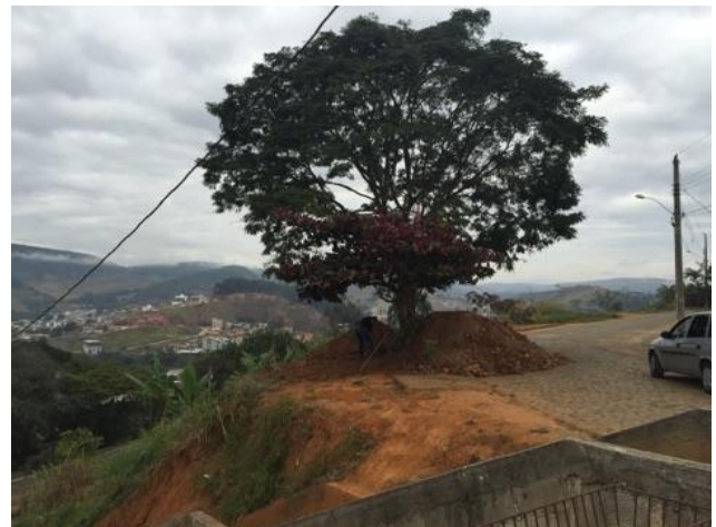
Stage 2 – Tree Planting - 2014