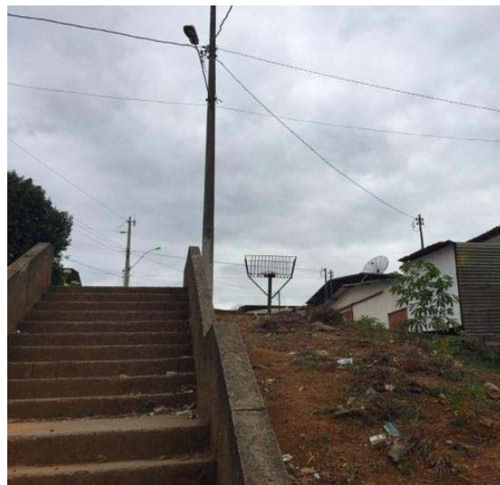
Pedestrian Bridge and Stairs – Early 2014