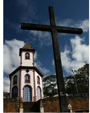
18 th Century Nova Era Church

With approximately 18,000 inhabitants, Nova Era is historically a mining town that has been settled for more than 300 years. In 1978 Artur Moreira's parents selected an empty plot of land and constructed their family house in an undeveloped area of Nova Era in the Brazilian state of Minas Gerais. Artur's family home would be the first of more than 200 houses constructed in the new development named Colina lying on the western side of Brazilian highway 381. While Brazil's vast size roughly equals that of the continental